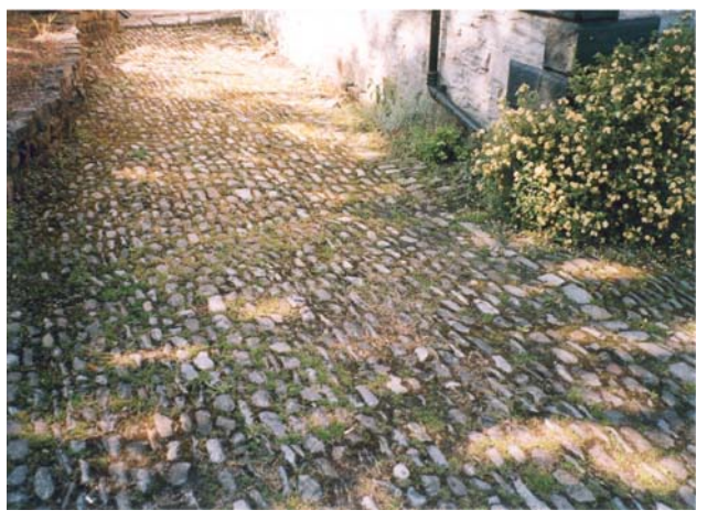
Stone cobbles beside the Coach and Horses

The Coach House and Church Gates have eaves-level stone brackets supporting the front rainwater gutter, a common detail in Ribble Valley.