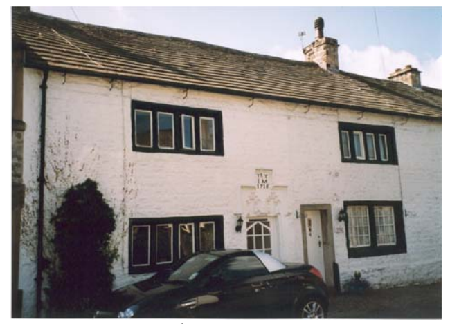
No. 4 Main Street, an 18<sup>th</sup> century house with stone roof tiles

close to the road but others, such as Church Gates, Gisburn Road or nos. 13-15 Hellifield Road are set back from the road behind a small private front garden, or parking. Generally speaking, buildings lie in a haphazard fashion beside highways of varying width and there is a spacious feeling with gaps between buildings and a high proportion of public and private open space.