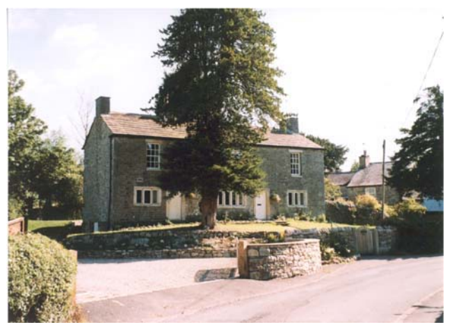
Large tree in front of nos. 13 and 15 Hellifield Road

The Coach and Horses dates from the late 18<sup>th</sup> or early 19<sup>th</sup> century. It was originally known as the Windmill Inn but was changed probably due to the arrival of a new squire and keen horseman at Bolton Hall. The building is constructed from squared watershot limestone. Watershot masonry is a technique whereby each stone is tilted downwards to reduce rainwater penetration as the water will drip vertically from the top of each block.