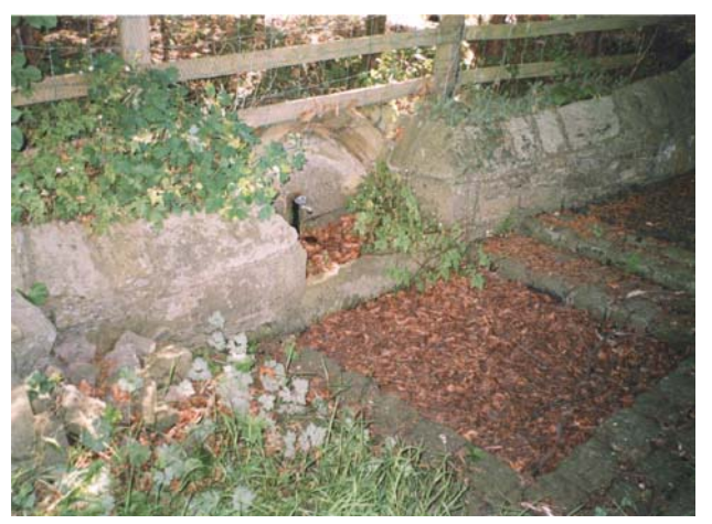
Site of old spring beside Stocks House