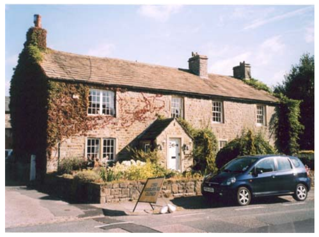
Local stone is the prevalent building material

Curves in the roads and the slight change in level within the conservation area result in ever-changing views of the historic buildings, trees and open spaces that make up the village.