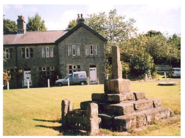
Old headless stone cross in Stocks Green

Local planning policies for the preservation of scheduled monuments and conservation of historic parks and gardens, listed buildings and conservation areas are set out in the Ribble Valley Local Plan which was adopted in June 1998 (Policies ENV14, ENV15, ENV16, ENV17, ENV18, ENV19, ENV20, ENV21) and the Joint Lancashire Structure Plan 2001-2016 which was adopted on 31<sup>st</sup> March 2005 (Policies 20 and 21, supported by draft Supplementary Planning Guidance (SPG) entitled 'Landscape and Heritage').