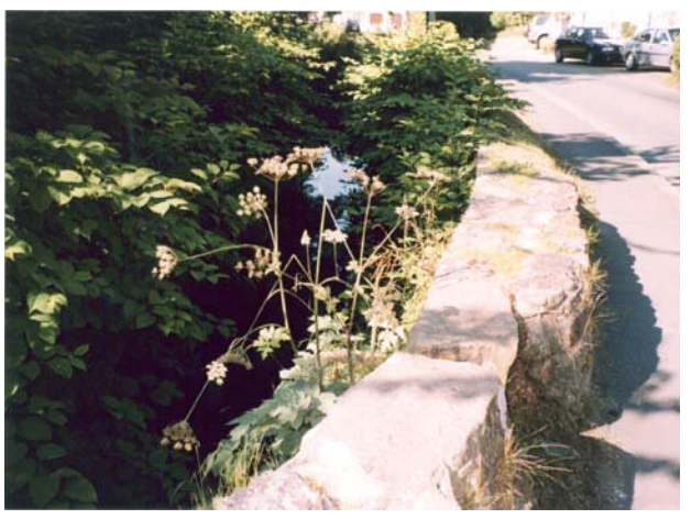
Kirk Beck in summer

Amongst unlisted buildings of note are Stocks House, a 19<sup>th</sup> century building which once contained a public reading room and used to be run as a shop and café, and a stone shed dated 1890 on the lane to Nook Laithe which was built to house the village hearse.