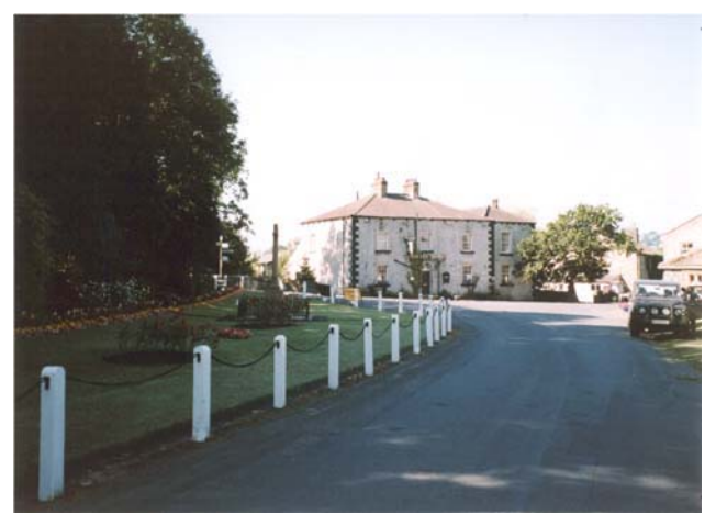
The Coach and Horses Inn with the War Memorial in shadow in the foreground

The boundaries of the conservation area have been drawn widely north of Hellifield Road and south of Gisburn Road to include land important to the rural setting of the village. In the north-west of the conservation area, the conservation area boundary encloses farm buildings at Nook Laithe and land next to Skirden Beck to ensure that the old track and traditional farm buildings are included within the conservation area.