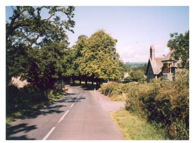
School House, Gisburn Road