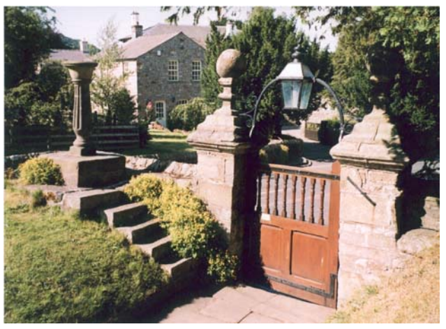
Sundial and entrance gate in the churchyard