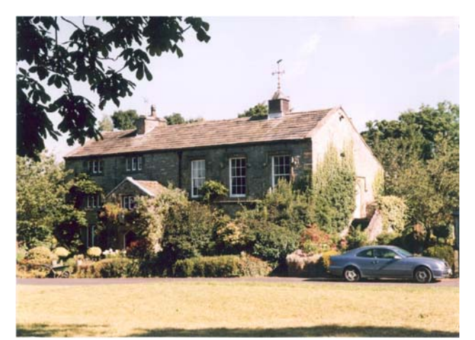
The Old Court House (grade II) was built in 1859 with much earlier remains

Many of the unlisted, and some of the listed, buildings in the conservation have been adversely affected by the use of inappropriate modern materials or details. Common faults include the replacement of original timber sash windows with uPVC or aluminium and the loss of original panelled front doors and their replacement with stained hardwood, uPVC or aluminium doors.