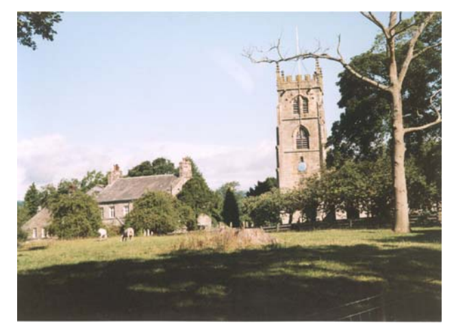
The Church of St Peter and St Paul (grade I) is essentially medieval but nothing remains of its Norman origins

This appraisal builds upon national policy, as set out in PPG15, and local policy, as set out in the Local Plan 1998, and provides a firm basis on which applications for development within the Bolton by Bowland Conservation Area can be assessed.