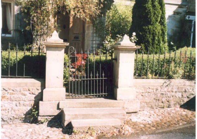
Ornate gate piers and old iron gate at Church Gates, Gisburn Road

In addition to the greens, trees and well tended private gardens, Kirk Beck is an equally special environmental feature, providing a haven for wildlife and abundant summer greenery. Though not prominent in the streetscene, being concealed behind a retaining stone wall for much of its course through the village, Kirk Beck, and the highly visible Skirden Beck which lies outside the conservation area, are an important part of the village's distinct local identity. The stone bridge in the centre of the village is dated 1897, rebuilt in 1977.