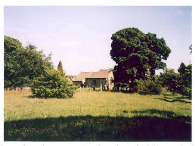
Trees and meadow flowers in the churchyard of St Winifred's Church

There are relatively few brick-built buildings in Ribchester. The oldest are three houses in the centre of the village, one of which is dated 1777 and the other two of which date to 1745. The houses are fairly large and impressive, and brick would have been used to make a statement about the status and quality of the buildings. Most brick-built structures in Ribchester date to the end of the nineteenth or early twentieth century, when factory-made brick was readily available. This can be seen in small areas of terraced houses and an early twentieth century mission church on Blackburn Road. In some cases, stone was used for the front elevations, with brick to the rear and sides. The late date of the terraces is reflected in the use of large bay windows and small front gardens, features which had become common in terraced houses of all sizes by the end of the nineteenth century.