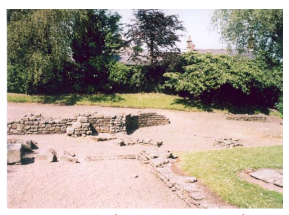
Roman Bath House (remains of)

Ribchester's greatest period of expansion and prosperity was from the late eighteenth century, when rows of handloom weavers' cottages were built in Church Street and Water Street, transforming a small rural settlement into an industrial village. Even though two small cotton mills opened in Ribchester in the second half of the nineteenth century, the village's position, isolated from the main area of industrial expansion in east Lancashire, meant that its potential as an industrial centre was never realised.