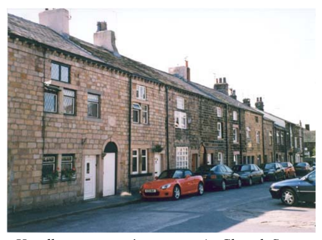
Handloom weaver's cottages in Church Street

Stydd is approached via a narrow single track road. After leading first to the Roman Catholic Church of Saint Peter and Saint Paul, a listed 'barn church' built in 1789, then Stydd Almshouses (1728), the road becomes a rough track that continues to the late 12<sup>th</sup> century Church of St Saviour.