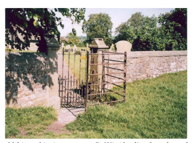
Old iron kissing gate to St Winifred's churchyard