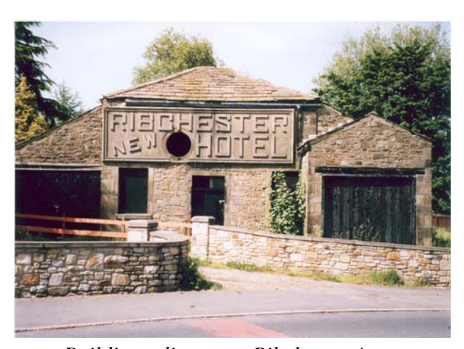
Building adjacent to Ribchester Arms

Schools. The present primary school was built as a National School in 1872. There was also a Roman Catholic school in Stydd Cottage up to about 1861, where boys were taught on the ground floor, girls on the first floor. The cottage was demolished in 1965.