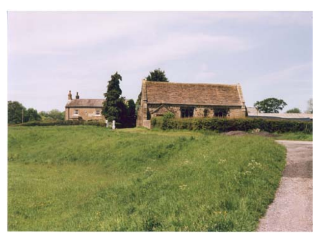
St Saviour's Church, Stydd

There are a large number of characteristically eighteenth-century houses in Ribchester, and other, apparently eighteenth century buildings hide older origins, such as 48 Church Street, which dates from 1680. Number 49 Blackburn Road has a datestone door lintel, inscribed 'R W 1700', re-used as a window sill. The process of adaptation continued, for example at Churchgates, which was converted into one house from a terrace of three seventeenth-century cottages in 1906.