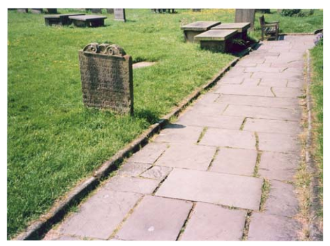
Natural stone paving leading to the south door of St Winifred's Church

The conservation area is primarily residential. The former Bee Mill on the north-east of the town is the workplace of a small number of businesses, just outside the conservation area. There is a small supermarket in the town, a teashop and cafe but currently (August 2005) no post office. There are four churches (Anglican, Roman Catholic and Evangelical) and three pubs or inns (White Bull, Black Bull and Ribchester Arms). Ribchester Museum, established in 1914 and dedicated to the Romano-British history of Ribchester, is a popular attraction, recently extended. The Ribble Valley Way, a middle-distance footpath that follows the full 70 miles of the river, from its source at Ribblehead in North Yorkshire to the flat, tidal marshes of its estuary west of Preston, passes through the conservation area. The sound of the St Wilfrid's primary school bell is a feature of the southern end of Church Street.