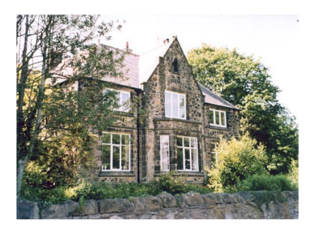
The Victorian Rectory overlooks the River Ribble

To the north and south of Ribchester the land rises markedly, with Longridge Fell (5km to the north), an isolated Pennine outlier, rising to over 350m, and Anglezarke Moor, less than 16km to the south. To the west, the land drops gradually to the flat, former mosslands, of the Lancashire Fylde. Adjacent to the village, the Ribble is between 15m and 25m wide in summer, but in flood can overflow to as much as 250m at the meander opposite the end of Church Street.