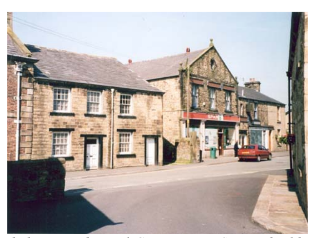
Former Ribchester Industrial Co-operative Society building (1886), Church Street (right)