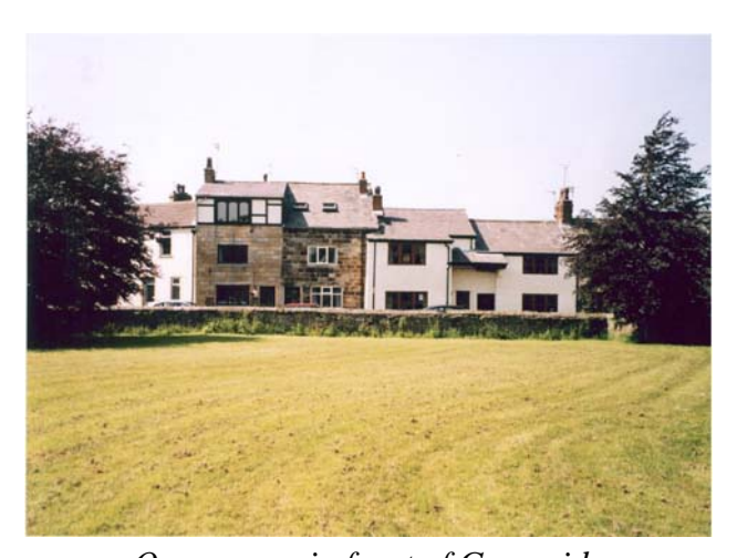
Open space in front of Greenside