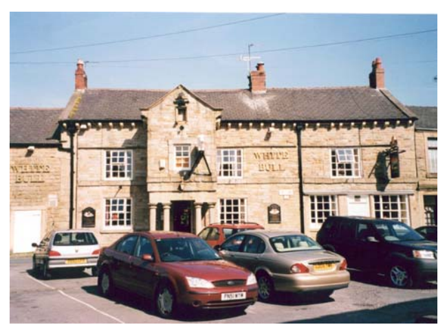
The White Bull dates from the early 18<sup>th</sup> century

This document should be read in conjunction with national planning policy guidance, particularly Planning Policy Guidance Note 15 (PPG 15) – Planning and the Historic Environment. The layout and content follows guidance produced by English Heritage, the Heritage Lottery Fund and the English Historic Towns Forum.