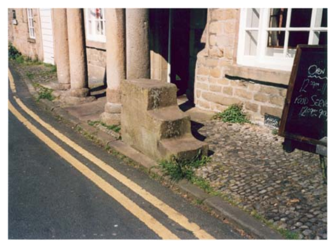
Mounting block formed from a single piece of sandstone at The White Lion

continued to be used. Some of the cottages whilst being broadly vernacular in style have high quality classically inspired detailing on their sandstone door surrounds. As with many other towns where nineteenth century development was limited, the physical environment retains a distinctive local individuality. Typically of such settlements, the status of the buildings and the occupants was mixed throughout and there was no development of specific class related areas. Overall, however, there is a high proportion of handloom weavers' cottages, built as two-up, two-down properties. Some had either first floor or ground floor weaving windows, but others had separate loomshops added to the rear of the buildings, or in the rear yards. Although the highest concentration of weavers' cottages is in Church Street and Water Street, loomshops in Greenside and Stydd illustrate that provision for handloom weaving was provided throughout the settlement. Nos 16-22 Church Street had attic loomshops but there is little evidence for the use of cellar loomshops, as Ribchester's location within the floodplan of the River Ribble would have made them susceptible to flooding. There is a pair of cottages at 61 and 62 Church Street, however, with former cellar loomshops.