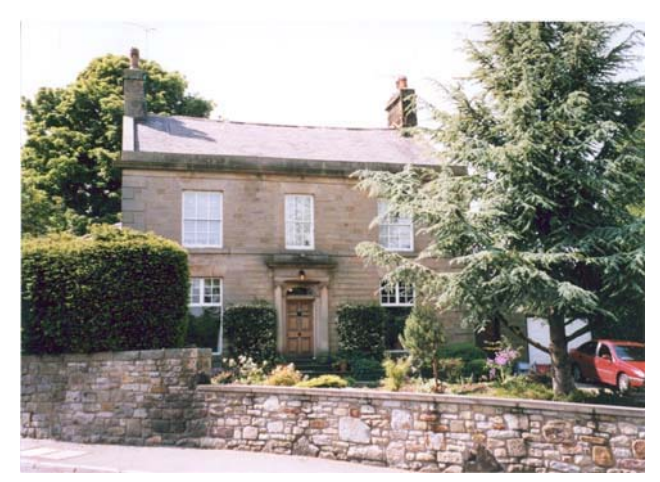
Stone House, Blackburn Road

This appraisal builds upon national policy, as set out in PPG15, and local policy, as set out in the Local Plan 1998, and provides a firm basis on which applications for development within the Ribchester Conservation Area can be assessed.