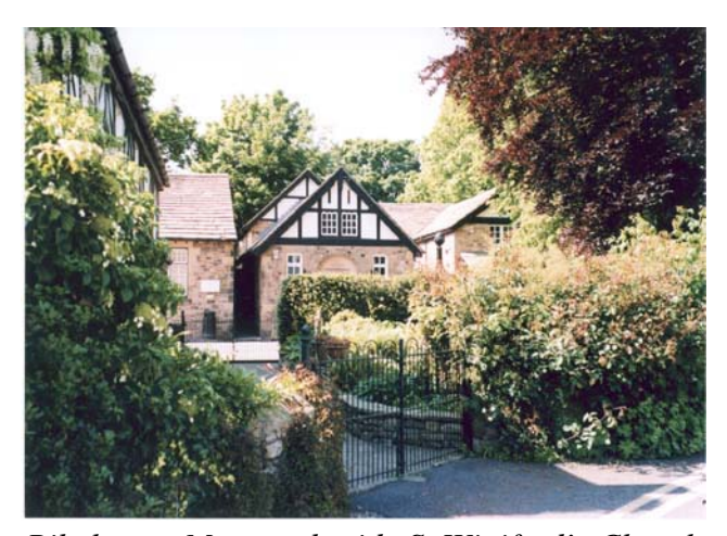
Ribchester Museum beside St Winifred's Church

There is no indication that any of Ribchester's streets were laid out to provide vistas of distant points, although their layout does focus on the open area in front of the White Bull. Ribchester's post medieval development as a handloom weavers' settlement has resulted in quite narrow, closely developed streets. The area around the church is the most open area, where the Rectory, a large house known as Churchgates, and the Museum are laid out spaciously, with views across the river to open countryside.