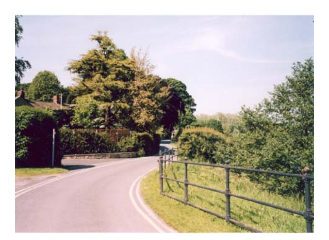
Iron railings and greenery beside the Ribble

The church appears to have been established after the Domesday Survey of 1086, which does not mention a church at Ribchester. It may have been established in the twelfth century, following its transfer to Blackburn Hundred, and the building does contain a Romanesque window. In general, however, the church is thirteenth-century in style. The north, or Dutten, chapel, and south porch were added in the fourteenth century, and the west tower in the late fifteenth century. A chantry was founded in 1405.