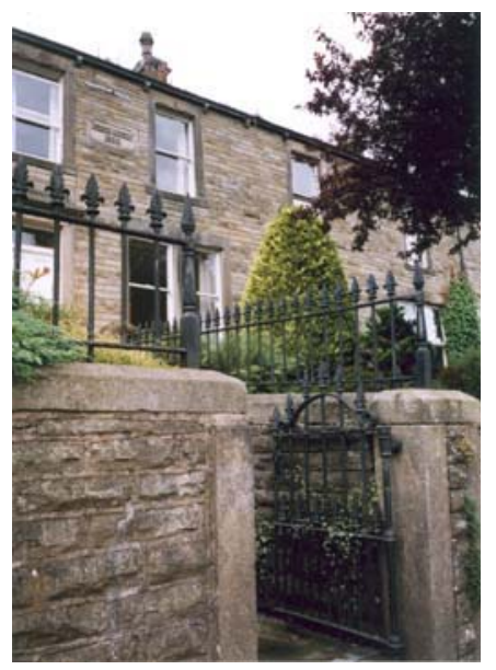
Beech Mount, Nos 98 to 101 The Square

Later 19th century and early 20th century housing consists of terrace rows or villas, with sash windows, panelled doors and boundary walls topped with railings and matching iron gates. Beech Bank has two pairs of 1930s semi-detached houses with two-storey bay fronts and leaded and stained glass to the windows and recessed porch.