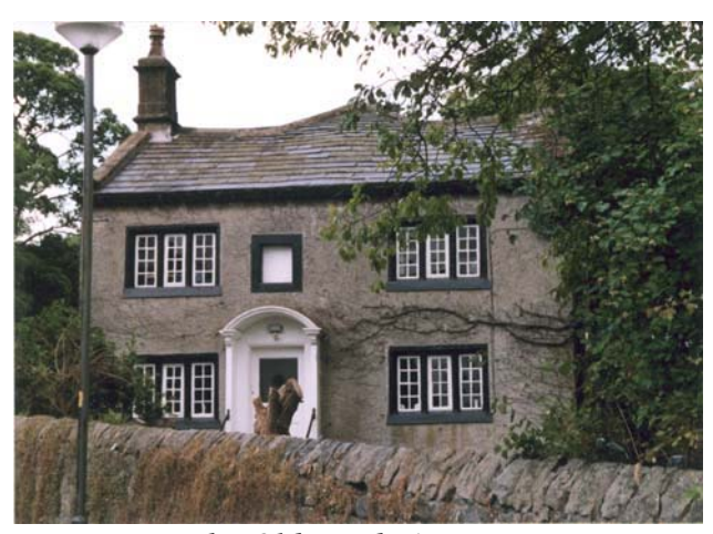
The Old Reader's House

Waddington is primarily a residential village, but with several thriving businesses, consisting of three pubs serving food, a cafe located in the Assembly Rooms, a bed and breakfast establishment in Regent Street, a Post Office and village store, and an architectural practice (at West End Lodge). In addition, there is a working dairy and beef farm within the conservation area at Carter Fold Farm.