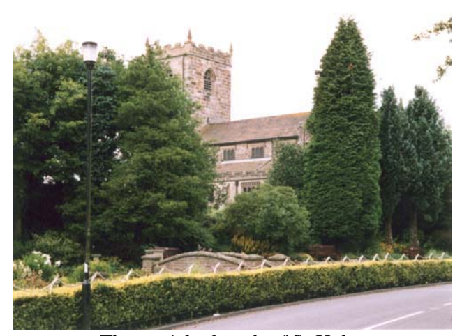
The parish church of St Helen

This appraisal builds upon national policy, as set out in PPG15, and local policy, as set out in the Local Plan 1998, and provides a firm basis on which applications for development within the Waddington Conservation Area can be assessed.