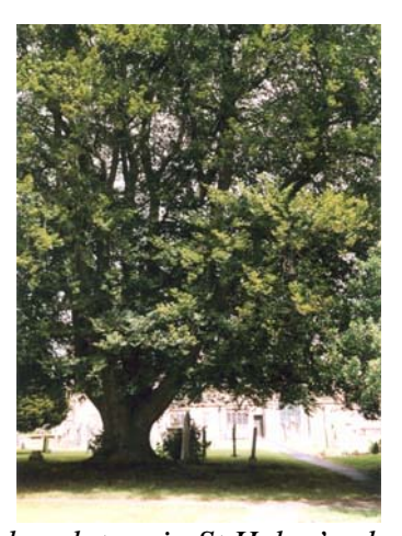
Veteran beech tree in St Helen's churchyard

The buildings vary, but generally date to the 19<sup>th</sup> century. Some are modest cottages, but they are considered to be good, relatively unaltered examples, of their type. Others are historic buildings that probably should have been listed, including two 18th century public houses. The survival of original materials and details, and the basic, historic form of the building, is important, as is the contribution that they make to the built environment. Where a building has been adversely affected by modern changes and restoration is either impractical or indeed, not possible, they are excluded.