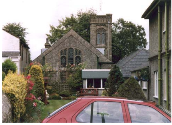
The Methodist Chapel of 1907

Despite the appearance of charming antiquity, many of Waddington's most prominent buildings are the results of building work carried out in the early years of the twentieth century, including the parish church, which was rebuilt (with the exception of the tower) in 1899 to 1901, the neo-Tudor Waddington Hall, also largely rebuilt in 1901, and the Methodist Chapel, rebuilt in 1907. The terrace rows south of Waddington Hall at the southern entrance to the village date from 1881 and 1893, and those on Beech Mount opposite the church date from 1900. The Waddington Hospital almshouses, though founded in 1700, were rebuilt in 1891.