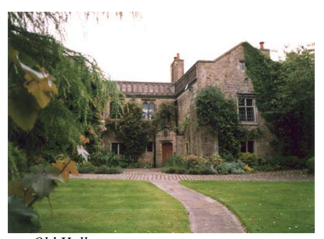
Waddington Old Hall

After the Conquest, Waddington was part of the very large parish of Great Mitton, which in turn was held by Cockersand Abbey until in 1438 Waddington, West Bradford and Grindleton were severed from the parish of Mitton to form a separate parish, in the diocese of York, with its parish church at Waddington. It is possible that an existing chapel was used as the parish church initially. The present church has nothing structural earlier than the first decade of the 16th century, when the Perpendicular tower was built.