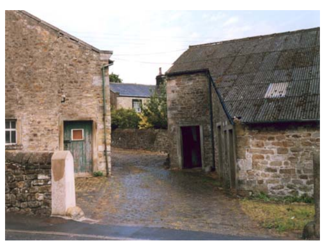
Carter Fold Farm

The distinctive Ribble Valley feature of shaped stone gutter brackets at eaves level is not as common here as in other nearby villages (such as Chatburn), and where gutter brackets do exist, they are on late 19th and early 20th century buildings (for example, Beech Mount of 1900).