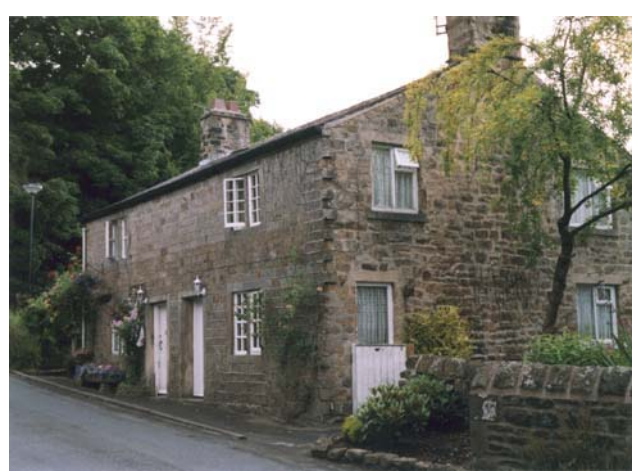
Nos 79 and 80 Slaidburn Road