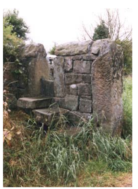
Stone stile opposite Carter Fold Farm, Slaidburn Road