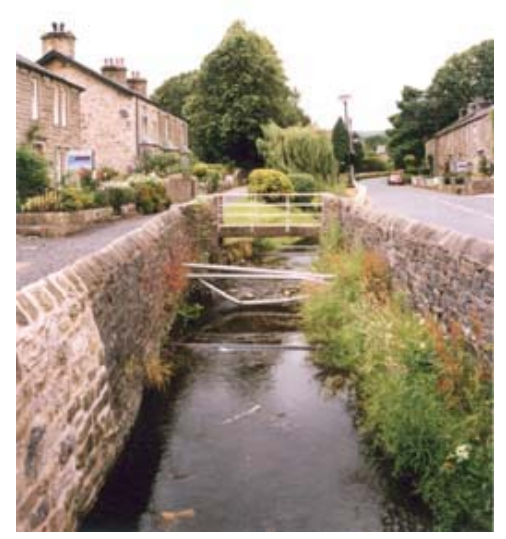
Plastic conduit disfigures Waddington Brook

The western boundary of the conservation area currently runs to the east of the footpath that runs along the brook Beech House to Bonny Bargate Farm. The boundary should move to the western side of the footpath, to take in the footpath itself and the boundary bank and hedge that defines the western side of the footpath.