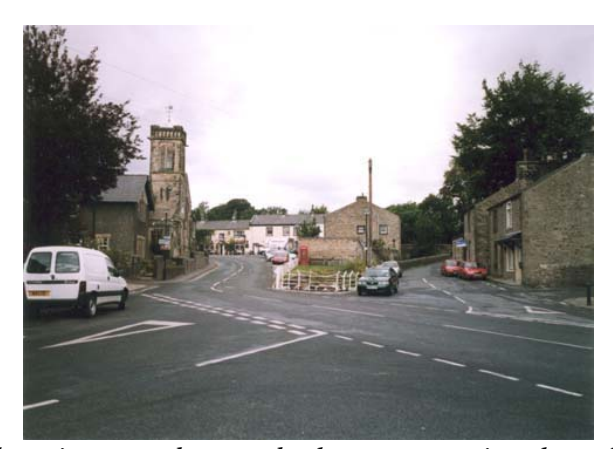
The village is centred around a large open triangle, called The Square

Leading eastwards out of The Square is West Bradford Road, where Waddington Hospital consists of neo-Tudor cottages (with tall chimneys and herring-bone timbers decorating the gables) set round three sides of a spacious tree-lined lawn, enclosed by walls and cast-iron railings to the south. Though the foundation of the almshouse dates from 1701, only the entrance gate and a pump survive from this period, the 29 cottages and chapel of the present hospital having been rebuilt in1891.