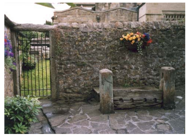
Grade II listed stocks and pinfold, north of the church

The conservation area takes in about half of the village, excluding areas of recent development (from the 1930s) in the southern half of the village and the houses, farms and school that are located along the West Bradford Road, most of which are, again, 1930s or later in date. Beyond this, the village is surrounded by pasture and small fields watered by brooks and tributaries of the Ribble.