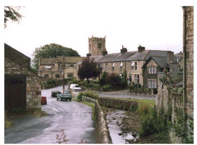
The location, on the banks of the Waddington Brook

Local planning policies for the preservation of scheduled monuments and conservation of historic parks and gardens, listed buildings and conservation areas are set out in the Ribble Valley Local Plan which was adopted in June 1998 (Policies ENV14, ENV15, ENV16, ENV17, ENV18, ENV19, ENV20, ENV21) and the Joint Lancashire Structure Plan 2001-2016 which was adopted on 31st March 2005 (Policies 20 and 21, supported by draft Supplementary Planning Guidance (SPG) entitled 'Landscape and Heritage').