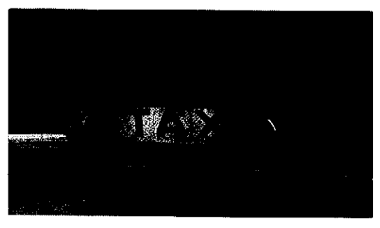
Standard Taxi Test £78.00