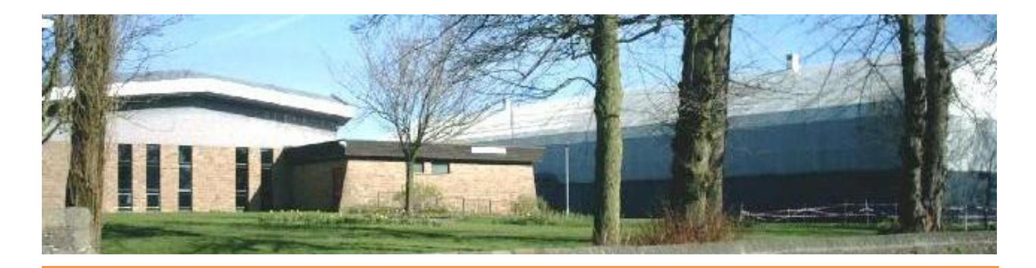
Priority 3 - To help make people's lives safer and healthier

Ribble Valley is a low crime area and a safe place to live. It is the safest place in the north-west and second safest place in the country. This success is in part due to the excellent work of our Community Safety Partnership.