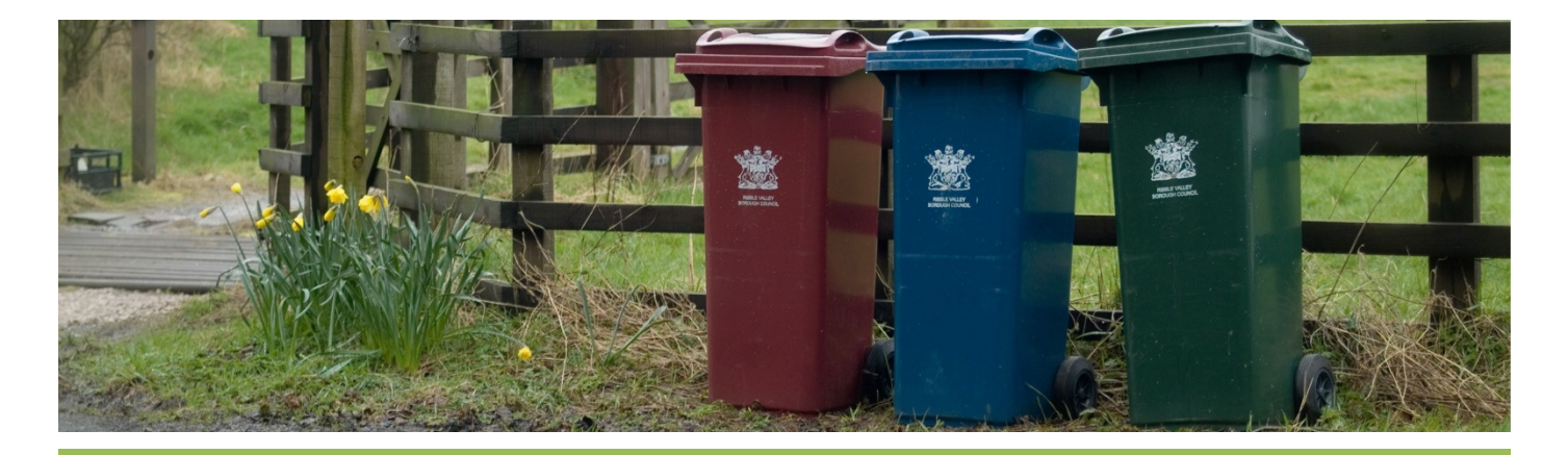
Priority 4 - To protect and enhance the existing environmental quality of our area

Our ambition is to protect the local environment, parts of which rank amongst the finest in England. The Council provides a high quality environment, including safe, clean parks and open spaces.