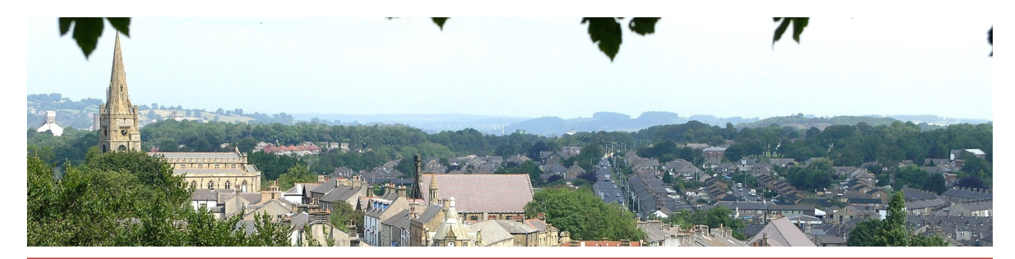
Priority 1 - To ensure a well-managed council providing efficient services based on identified customer needs

Full details of our approach are set out in our Equality and Diversity Policy.