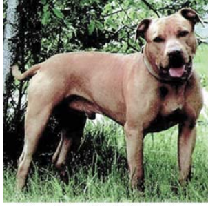
American Pit Bull Terrier