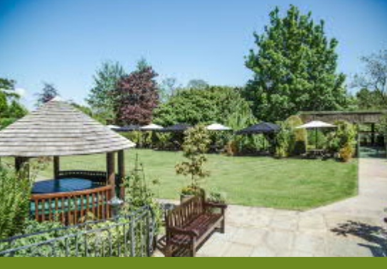
More self-guided walks with great, safe dining experiences