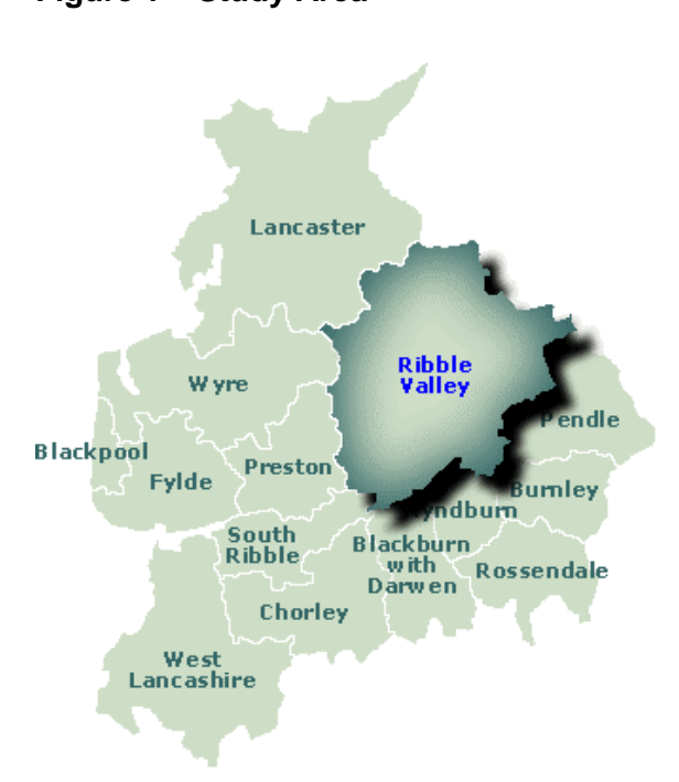
Figure 1 - Study Area