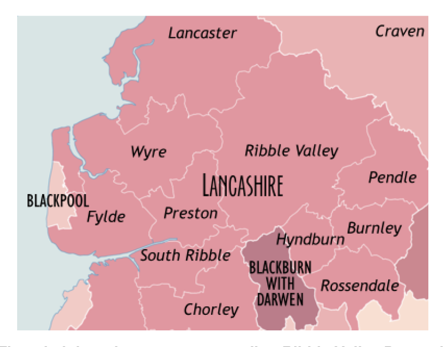
Figure 1: The administrative areas surrounding Ribble Valley Borough Council