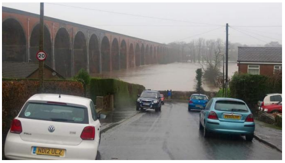
River Calder at Billington - Whalley Viaduct

We will continue to meet with representatives of the Flood Action Group during this time, and look to hold further drop-in events at suitable points in the project. Our discussions with the FLAG and community will be an important part of the process as we work towards better protecting Whalley and Billington from flooding.