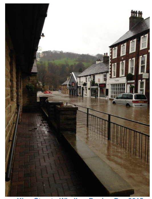
King Street - Whalley, Boxing Day 2015

The aim of Flood Re is to provide support to those that need it most. As a result there are a number of criteria that need to be met for a property to be eligible for entry into the Flood Re scheme, which sets the cap on the cost of flood cover. See <a href="https://www.floodre.co.uk/eligibility">www.floodre.co.uk/eligibility</a> for details.