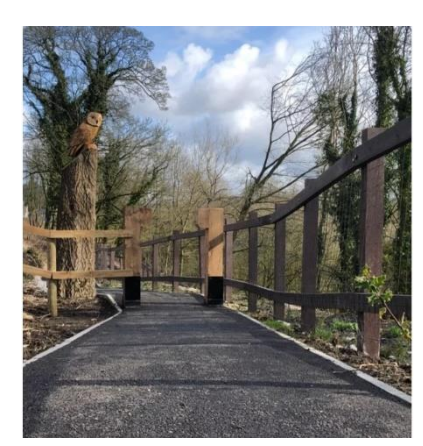
Primrose Lodge, Clitheroe.

3.13 Key statement EN3 of the Adopted Core Strategy sets out that new development in vulnerable areas should ensure that risks can be managed through suitable measures, including through the conservation of biodiversity, improvement of ecological networks and the provision of green infrastructure. The Council's commitment to conserving and enhancing the area's biodiversity and geodiversity is reiterated on Key Statement EN4. Where appropriate off-site commuted sums will be secured to enhance biodiversity within the Borough.