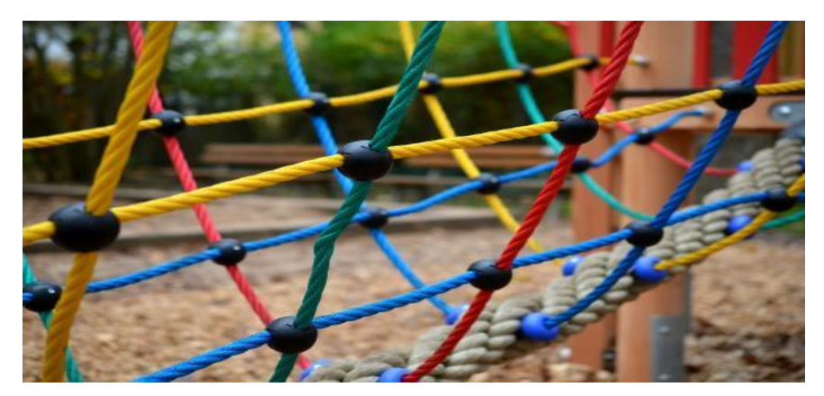
Holme Play Area, Sabden – Supported by S106 contributions.