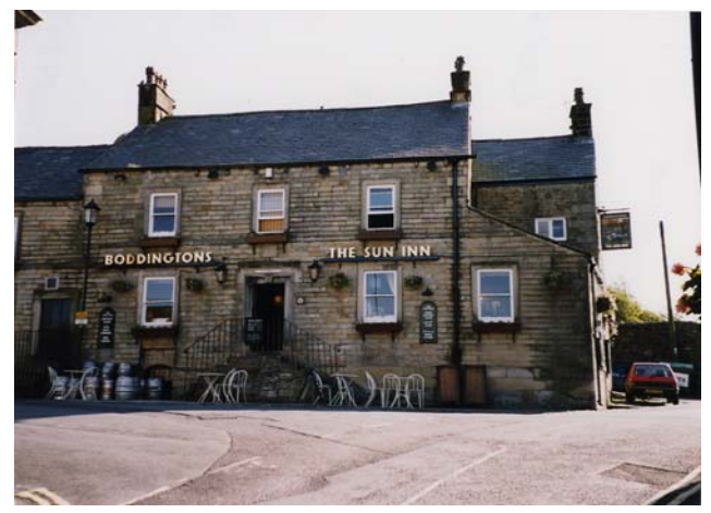
The Sun Inn overlooks the probable site of an ancient market

Windy Street, as it runs south-west from the square, begins as a narrow enclosed route then widens outside nos. 29 &33 (John Brabin's Almshouses) where, on the opposite side of the road, houses are set back from the road behind small front gardens. From here, a lane drops steeply down to a discreet out-of-the-way area around St Mary's Roman Catholic Church, beside the brook. St Mary's Church, Presbytery and Old School were built in 1827. Constructed with ashlar stone and Welsh slate roofs, they have a formal classical appearance quite different to the much earlier vernacular dwellings along Talbot Street and Windy Street. Tall trees overshadow a narrow graveyard and stone boundary wall, railings and a hedge add to the formality of the area.