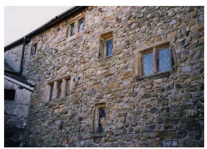
Stone mullioned windows at the rear of no. 15 Windy Street

There are several long views to distant hills, notably Pendle Hill which is visible from the church steps, and Wolf Fell, looking northwards from the southern end of Windy Street. A similar view can be gained from St Bartholomew's churchyard. Views of the wider landscape from the village edge help to reinforce the village's distinctive rural location.