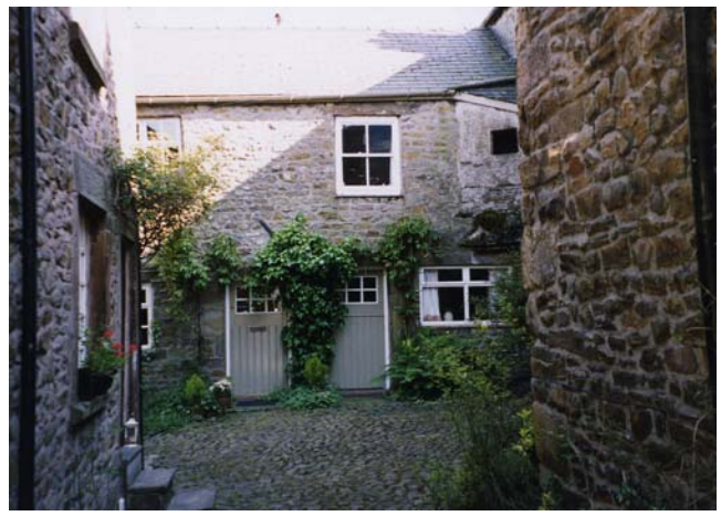
Stone cobbled passage to nos. 7 to 11 Windy Street