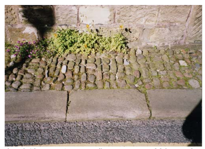
An example of Chipping's stone floorscape: cobbles and stone kerbs

Chipping receives many visitors, particularly at the weekends during the summer months. The majority arrive by car but some leave their vehicles in the area whilst walking on the nearby Fells.