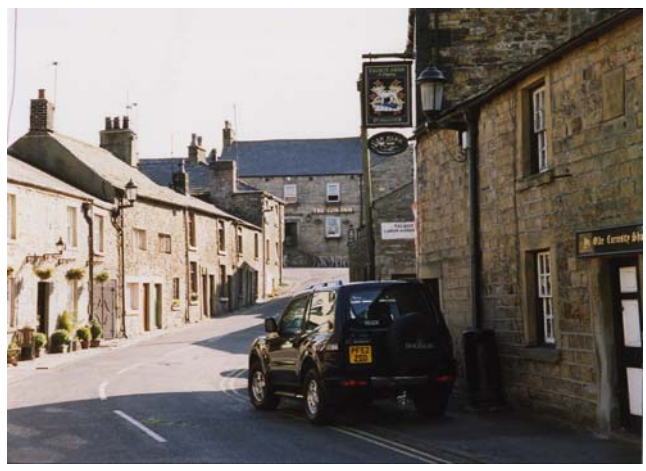
The Sun Inn closes the view up Talbot Street