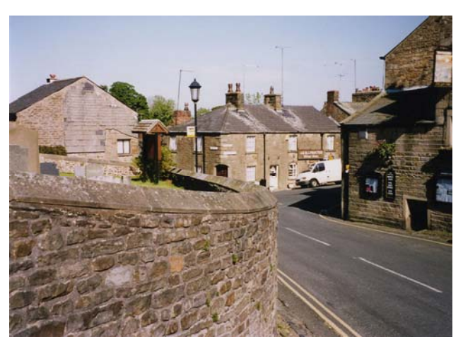
Junction of Talbot Street and Windy Street from the church steps

The Chipping Conservation Area was designated on 7<sup>th</sup> October 1969. This document updates and replaces the Conservation Area Appraisal for Chipping which was prepared by the County Planning Officer in 1971.