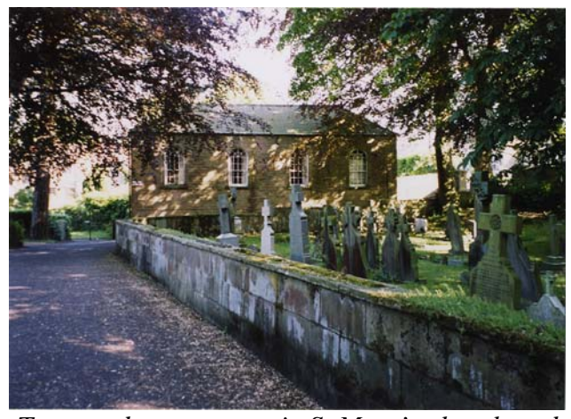
Trees and gravestones in St Mary's churchyard

Welsh slate sizes vary and some of the roofs are laid using diminishing courses of slate (e.g. no. 5 Windy Street). Difference in size can be seen by comparing the large slates on nos. 1 & 3 Windy Street with the small slates on no. 5 Talbot Street, across the road. The roof of no. 24 Talbot Street, beside the brook, has a decorative horizontal band of unusual rounded slates.