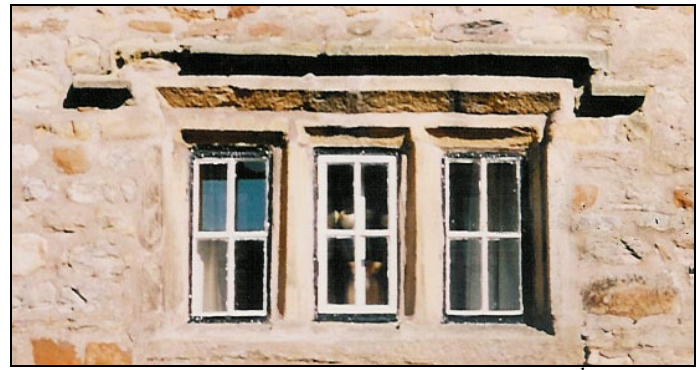
Stone mullioned window dating from the 17<sup>th</sup> century

It is recommended that an area west of St Bartholomew's Church be added to the conservation area. The proposed area is marked on the Townscape Appraisal map and includes: Chipping Congregational Chapel, opened in 1882 (grade II); Club Row (nos.14-20 Club Lane), which was built in 1822 by the Chipping Brothers' Friendly Society; nos. 2-8 Club Lane, containing a former smithy; nos. 2 and 4 Church Raike (grade II) and an area of green open space which has the role of a modern village green.