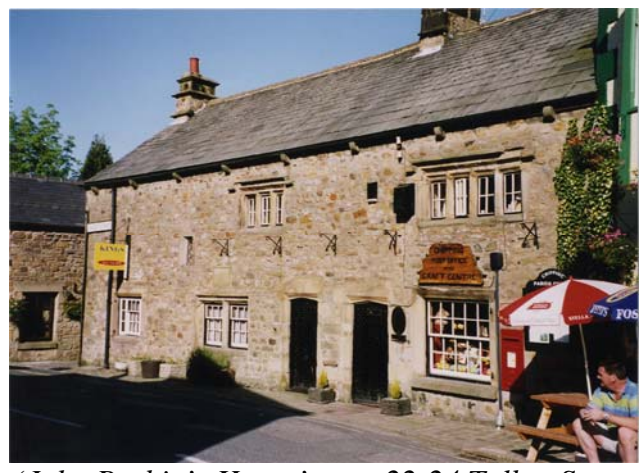
'John Brabin's House', nos. 22-24 Talbot Street

Chipping flourished industrially when the water power of the district was fully developed. By the mid 19<sup>th</sup> century there were 7 water powered mills on Chipping Brook, some above, some below the village. There were two cotton spinning mills, and works producing spindles and flies and rollers for spinning machines, an iron and brass foundry, a corn mill, a nail works and a chair works. Chipping is still well known for its chairs but there is little evidence of the village's industrial past to be seen in the Chipping Conservation Area.