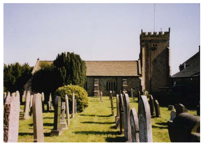
St Bartholomew's Church

This appraisal builds upon national policy, as set out in PPG15, and local policy, as set out in the Local Plan 1998, and provides a firm basis on which applications for development within the Chipping Conservation Area can be assessed.