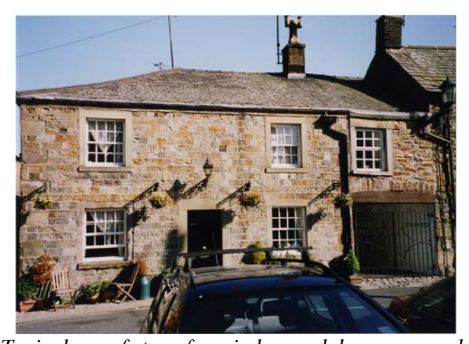
Typical use of stone for window and door surrounds

There is very little 20<sup>th</sup> century development within the conservation area. Nos. 18-22 Windy Street is a modern development that fits in well with the conservation area's historic appearance.