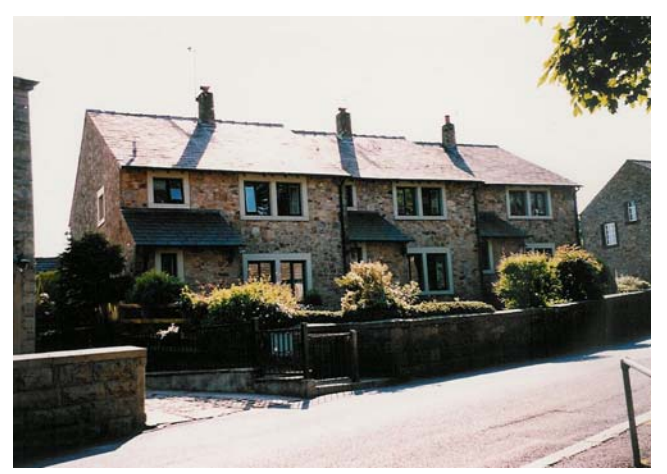
Modern dwellings that fit in with the conservation area