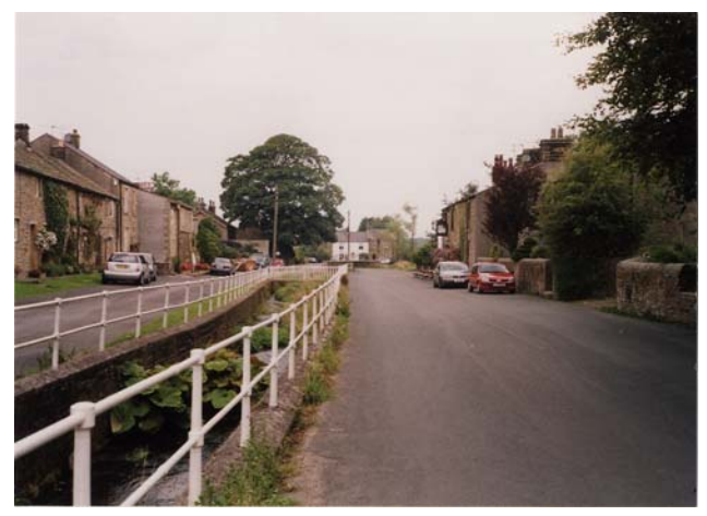
Looking north-west to Lyndhurst and Holly House