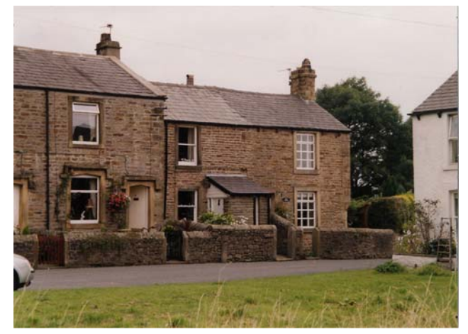
Local stone and slate characterise the conservation area

In the eastern part of the village, which is visually disjointed from the western part by a bend in the road, the view eastwards is closed by the oak on the green and the former primary school. Here there is a fine ensemble of village green, church, former school and farmhouse.