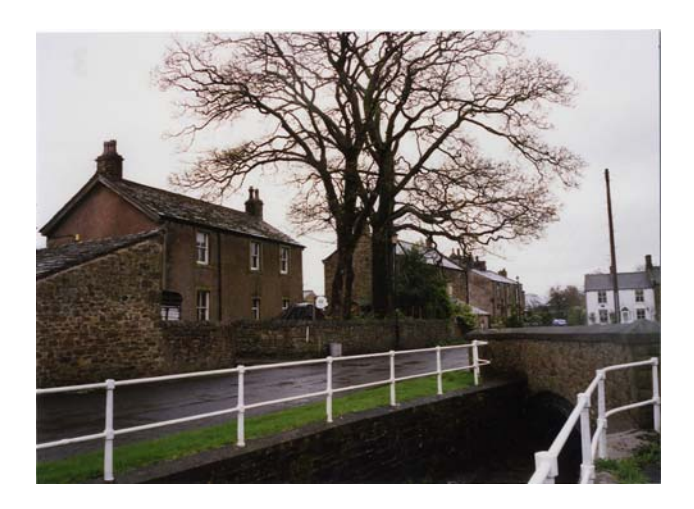
Large trees beside Bulcocks House

Local planning policies for the preservation of scheduled monuments and conservation of historic parks and gardens, listed buildings and conservation areas are set out in the Ribble Valley Local Plan which was adopted in June 1998 (Policies ENV14, ENV15, ENV16, ENV17, ENV18, ENV19, ENV20, ENV21) and the Joint Lancashire Structure Plan 2001-2016 which was adopted on 31<sup>st</sup> March 2005 (Policies 20 and 21, supported by draft Supplementary Planning Guidance (SPG) entitled 'Landscape and Heritage').