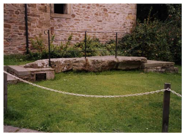
Fiddle Bridge, returned to the village in the year 2000