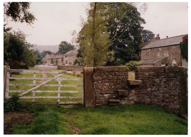
Stone stile on the footpath beside Bracken Deane

There are 12 listed buildings in Pendleton Conservation Area, the majority of which are associated with the village's agricultural heritage. The earliest listed building is Spring House Farmhouse which dates from the early 17<sup>th</sup> century and is built of sandstone rubble but is unfortunately roofed with imitation stone slates that mar its appearance. The adjoining barn (also grade II) has a roof of stone flags and an arched carriage opening. Hayhurst Cottage and Bulcocks House, both grade II, also date from the 17<sup>th</sup> century, the former with distinctive 17<sup>th</sup> century mullioned windows, the latter with a datestone of 1693.