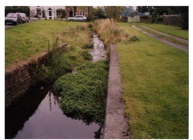
The banks of Pendleton Brook have a less formal appearance towards the northern end of the village

Pendleton lies in undulating lowland farmland on the lower slopes of Pendle Hill, at a height of about 130 metres above sea level. The conservation area slopes down in a north westerly direction from All Saints School to Holly House and Lyndhurst, the two 'bookends' of the village.