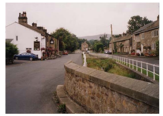
Stork House closes the south-east view down the main street

This appraisal builds upon national policy, as set out in PPG15, and local policy, as set out in the Local Plan 1998, and provides a firm basis on which applications for development within the Pendleton Conservation Area can be assessed.