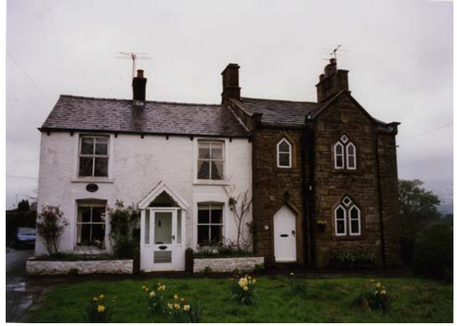
Holly House and Lyndhurst

<u>East View</u> and <u>Rock Terrace</u> date from the 17<sup>th</sup> and 18<sup>th</sup> centuries respectively. Both are of two low storeys with flag stoned roofs. The six cottages in East View front directly onto the street, whereas Rock Terrace stands back behind a wall and front gardens.