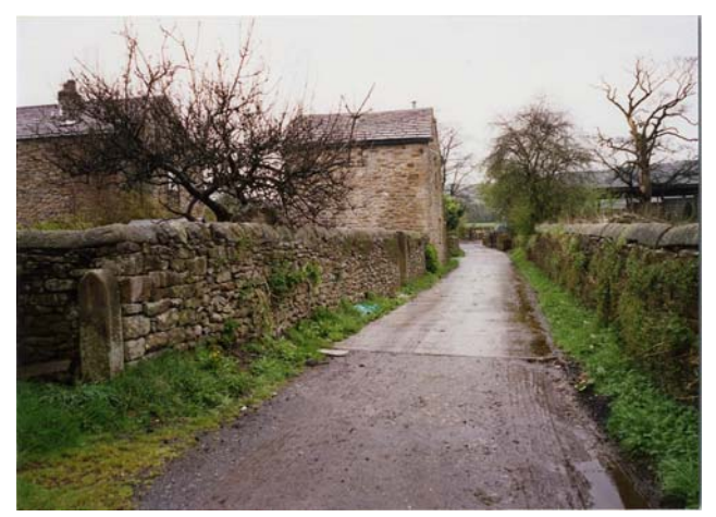
This 'back lane' has a very rural appearance