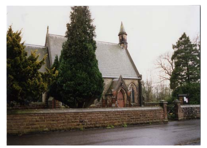
All Saints Church

The quiet atmosphere of the village is slightly disturbed by the background noise of traffic on the A59 (opened 1971), especially in the western part of the village. On the other hand, close to the brook, the sound of running water is a special feature of the conservation area.