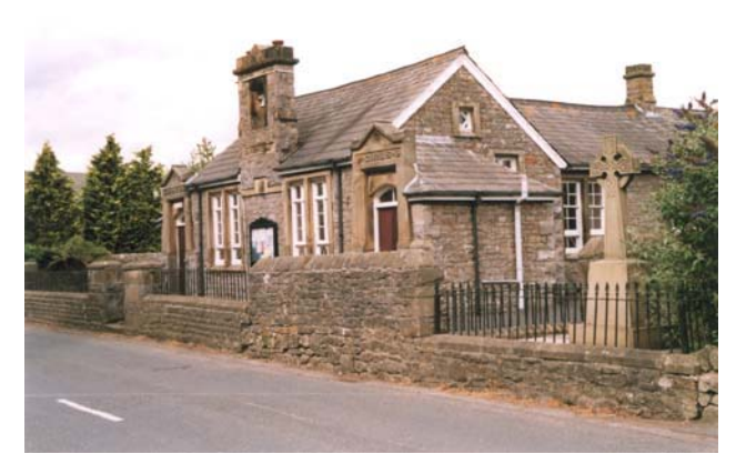
Sawley School, now the village hall

In addition, the following structures within the conservation area and located on the Sawley Road are listed under the parish of Grindleton: