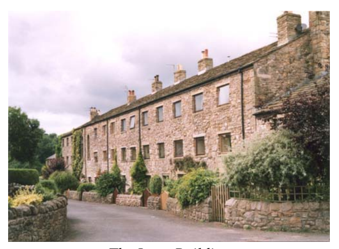
The Long Building

Sawley is one of a series of villages located at roughly 2km intervals along the northern banks of the River Ribble. Sawley's neighbours are all located on a terrace above the river. Sawley is the exception, being located partly in the floodplain, a position that caused problems to the founding monks who struggled to live on what must always have been a wet and cold location. It is noteworthy that a number of the properties constructed in Sawley from the 18th-century are located on slightly higher ground: an exception is the Long Building, whose site was dictated by the availability of medieval water channels that were reused for industrial purposes. Only in the 20th century has there been much building in the vicinity of the Abbey itself.