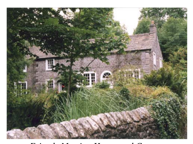
Friends Meeting House and Cottage

This appraisal builds upon national policy, as set out in PPG15, and local policy, as set out in the Local Plan 1998, and provides a firm basis on which applications for development within the Sawley Conservation Area can be assessed.