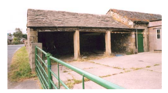
Southport House, cartsheds

In the twentieth century there has been much infill along the main street and the Sawley Road, so that half of the houses in the vicinity of the Abbey are of recent construction. Again this fact was noted and regretted in the Sawley Conservation Area Draft Proposal (1971), which said that these modern encroachments were not in keeping with the architectural character of the village, competed with the Abbey for visual dominance, and detracted from the setting of these important medieval remains.