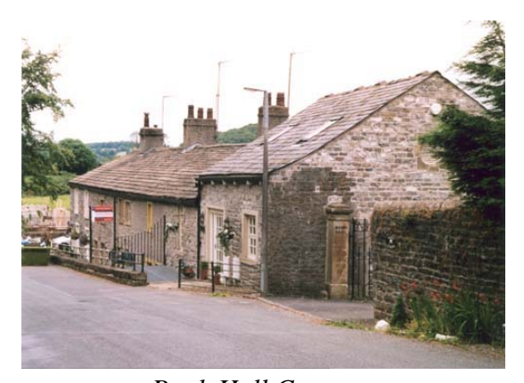
Bank Hall Cottages

There is an Edward VII post box set in the boundary wall of The Croft on Sawley Road.