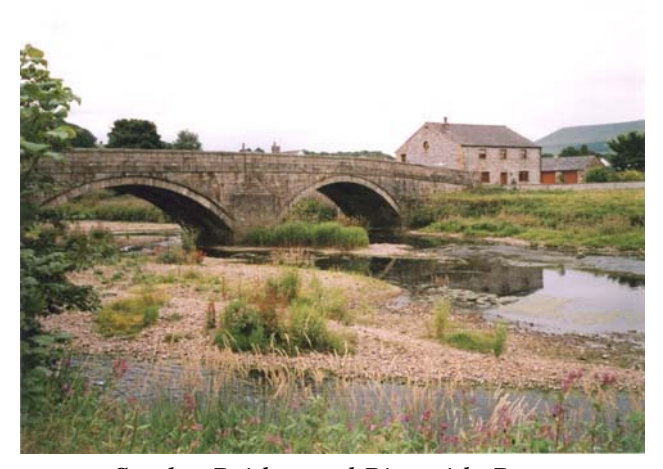
Sawley Bridge and Riverside Barn

Ribble, before ascending to the terrace on which the neighbouring villages of Grindleton, West Bradford and Waddington are located. This road has a number of 18th-century cottages, farms and houses located along both sides, including a 17th-century Quaker Meeting House. This part of the village lies in Grindleton parish, the river forming the parish boundary.