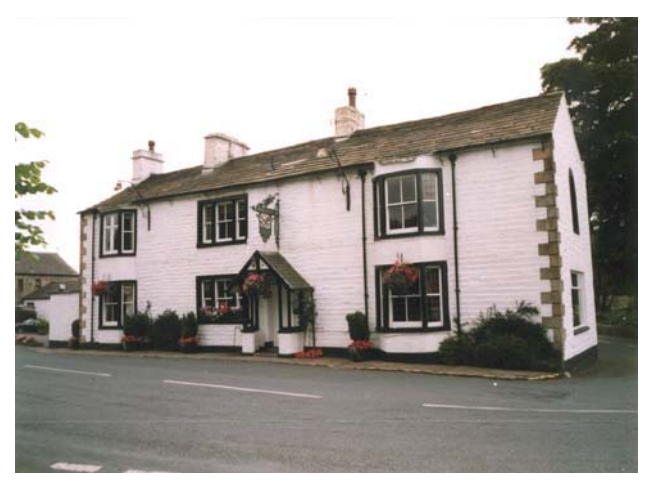
The Spread Eagle, with its watershot stone façade

Local planning policies for the preservation of scheduled monuments and conservation of historic parks and gardens, listed buildings and conservation areas are set out in the Ribble Valley Local Plan which was adopted in June 1998 (Policies ENV14, ENV15, ENV16, ENV17, ENV18, ENV19, ENV20, ENV21) and the Joint Lancashire Structure Plan 2001-2016 which was adopted on 31<sup>st</sup> March 2005 (Policies 20 and 21, supported by draft Supplementary Planning Guidance (SPG) entitled 'Landscape and Heritage').