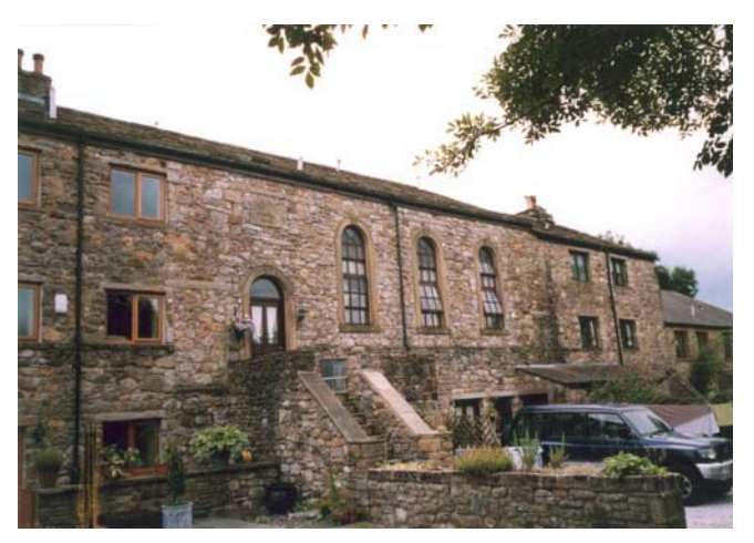
The Long Building; part converted to a Wesleyan Chapel and reading room in 1867

Two working farms are located within the village: Southport House (a listed building with a date stone of 1720) lies on the southern edge of the conservation area, while Bank Top Farm lies just outside the conservation area on the Grindleton Road.