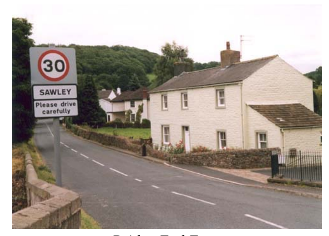
Bridge End Farm