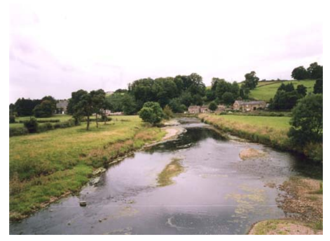
Looking west form Sawley Bridge to Bank View Cottages

The place was then known as 'Sallea', a name that probably means 'an open grove where sallows (willows) grow', suggesting that it was a wet clearing within a forest, all of which fits with the Cistercian preference for abbey sites in the wilderness, away from existing centres of population. Even by Cistercian standards, this was a difficult place to tame: contemporary records describe the area as 'terra nebulosa et pluviosa' ('a land of mists and rain') and 'for the most part barren and unfruitful'. Crops failed, food was short and the monks considered abandoning the settlement. In order to encourage them to stay, Maud de Percy, Countess of Warwick, daughter of the founder gave them the income from St Mary's, Tadcaster.