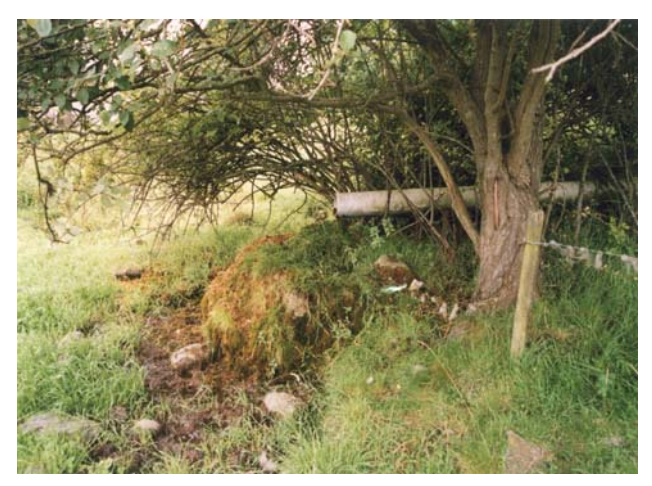
St Mary's Well, Sawley Park

• St Mary's Well in Sawley Park is overgrown and could be restored as an attractive historic feature of the village, especially if an ancient stone trough survives under the current vegetation - perhaps with the help of a Heritage Lottery Fund or Local Heritage Initiative grant.