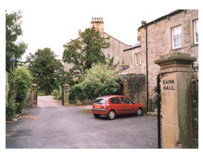
Bank Hall, built by William Tipping, MP for Stockport, in 1780

The village also has a number of traditional stone stiles: for example, along the path from Bank View Cottages to Sawley Bridge.