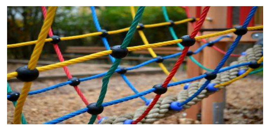
Holme Play Area, Sabden – Supported by S106 contributions.