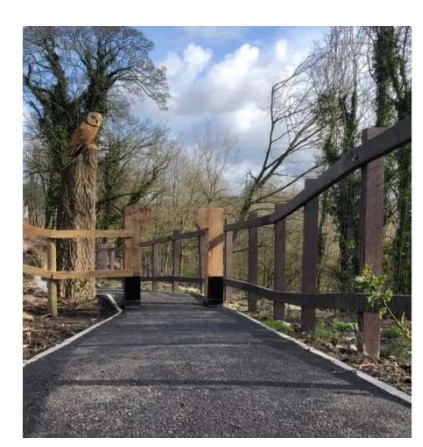
Primrose Lodge, Clitheroe.

3.12 Key Statement EN3 of the Adopted Core Strategy sets out that new development should ensure that risks can be managed through suitable measures, including through the conservation of biodiversity, improvement of ecological networks and the provision of green infrastructure. The Council's commitment to conserving and enhancing the area's biodiversity and geodiversity is reiterated on Key Statement EN4. Where appropriate off-site commuted sums will be secured to enhance biodiversity within the Borough.