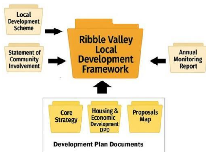
Fig 1: Ribble Valley LDF