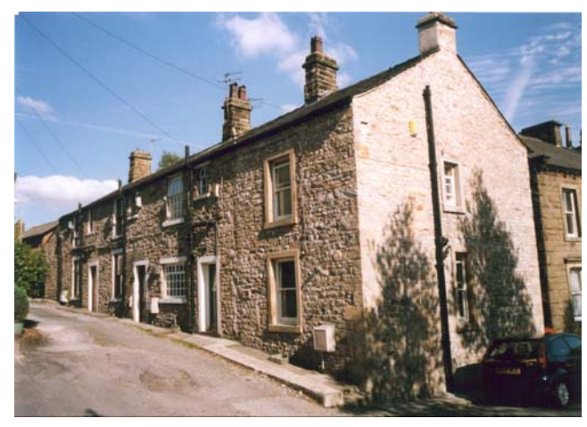
Harrison Terrace, Cross Fold

Local planning policies for the preservation of scheduled monuments and conservation of historic parks and gardens, listed buildings and conservation areas are set out in the Ribble Valley Local Plan which was adopted in June 1998 (Policies ENV14, ENV15, ENV16, ENV17, ENV18, ENV19, ENV20, ENV21) and the Joint Lancashire Structure Plan 2001-2016 which was adopted on 31<sup>st</sup> March 2005 (Policies 20 and 21, supported by draft Supplementary Planning Guidance (SPG) entitled 'Landscape and Heritage').