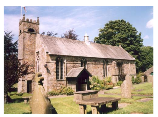
St Ambrose Church

The village is not on a major road: local traffic passes to the south of the conservation area, along the road that follows the terrace edge and runs parallel to the Ribble. Little traffic passes up the Main Street, which leads northwards from the village up to the Grindleton Fell.