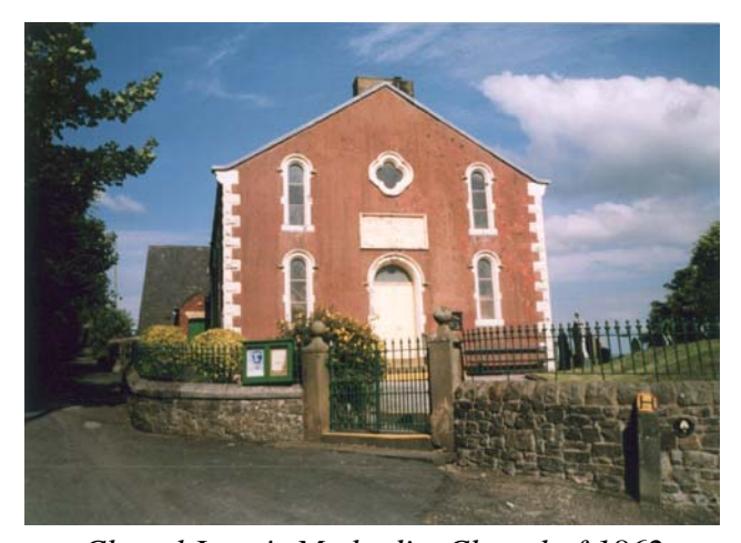
Chapel Lane's Methodist Chapel of 1862

The surrounding countryside is gently rolling, rising to a height of 300 metres to the forestry plantations, sheep pasture and open fells to north, looking out over the floodplain of the River Ribble, which is primarily used form dairy farming, and across to the steep flanks and shoulder of Pendle Hill; these southerly views are an important part of the character of the village.