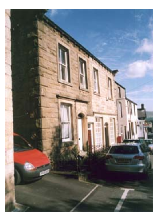
The Edwardian former post office at Nos 1 to 3 West View

Grindleton next features in the annals of history in the 17th century when it was the meeting place of a non-conformist sect called Grindletonians (the only example, other than the Plymouth Brethren, of a 17th-century sect being named after a place rather than a person, belief or practice). Grindleton was, until the 19th century, part of the very large parish of Greta Mitton, which is where the parish church was located, some 8km to the south west of Grindleton. Grindleton itself was served by a curate: no chapel survives from the medieval period, but the location must have been to the east of the village, close to Chapel Garth, between Upper and Lower Chapel Lane.