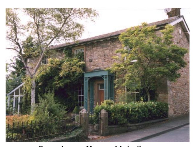
Rawsthorne House, Main Street

This appraisal builds upon national policy, as set out in PPG15, and local policy, as set out in the Local Plan 1998, and provides a firm basis on which applications for development within the Whalley Conservation Area can be assessed.