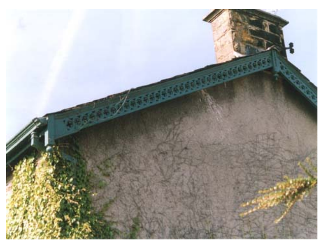
Traditional timber gutters, and quatrefoil barge boards at the Hollies

Along the Main Street, views out of the village are blocked by the tightly packed cottages on the eastern side of Main Street. On the eastern side, there are gaps between the buildings that allow views over steeply sloping pasture and allotments to the woodland that encloses the valley of the Grindleton Brook.