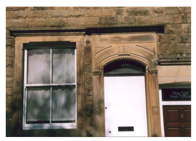
Stone door and window details, former post office, Nos 1 to 3 West View