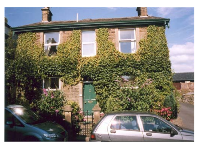
The Hollies: PVCu windows and rooflight in an otherwise original Edwardian house

The school and church are an integral part of the historic core of the village, albeit separated from the geographical centre of the village, and that both are buildings of some historical and architectural merit (the church is a Grade II listed building). Moreover, the open spaces between the village and the church are important for recreational purposes and for protecting the open views from the village to Pendle Hill. It is recommended that the boundary be extended accordingly.