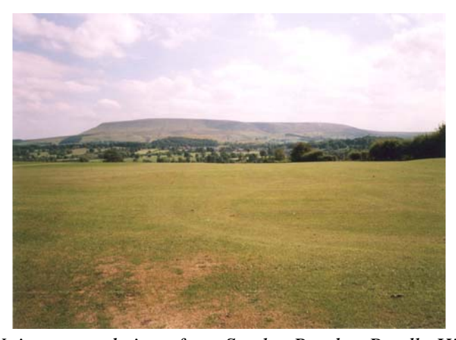
Uninterrupted views from Sawley Road to Pendle Hill

Section 71 of the same Act requires local planning authorities to formulate and publish proposals for the preservation and enhancement of any parts of their area that are designated as conservation areas. Section 72 specifies that, in making a decision on an application for development in a conservation area, special attention shall be paid to the desirability of preserving or enhancing the character or appearance of that area