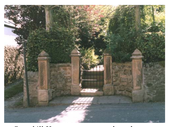
Stonehill House gateposts and garden gate

The village also has two public houses – The Duke of York and The Buck Inn – dating from the 18th century, both symmetrical double pile houses. It also has a number of former agricultural buildings, with carriage arches (at Stone Hill Farm, Swindlehurst Barn, Duck House Farm and Wythenstocks Barn, for example).