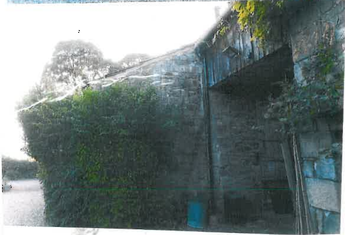
Photo 9 Abutment of Barn & part of Redhill Gate Farm