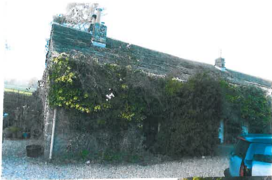
Photo 8 Return elevation of garage to abutment with Barn