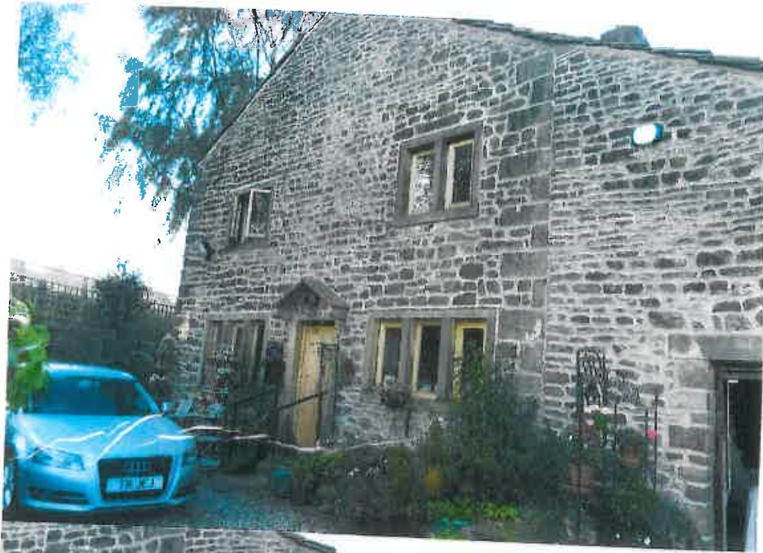
Photo 5 Existing Garage for proposed Conversion