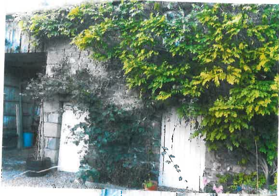
Photo 11 Barn Entrance Abutting Rockhill hedge