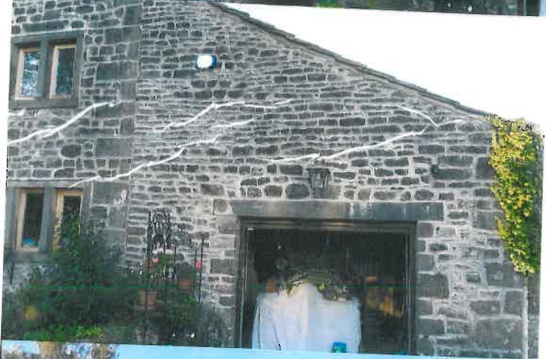
Photo 6 Front & side of Redhill hodge