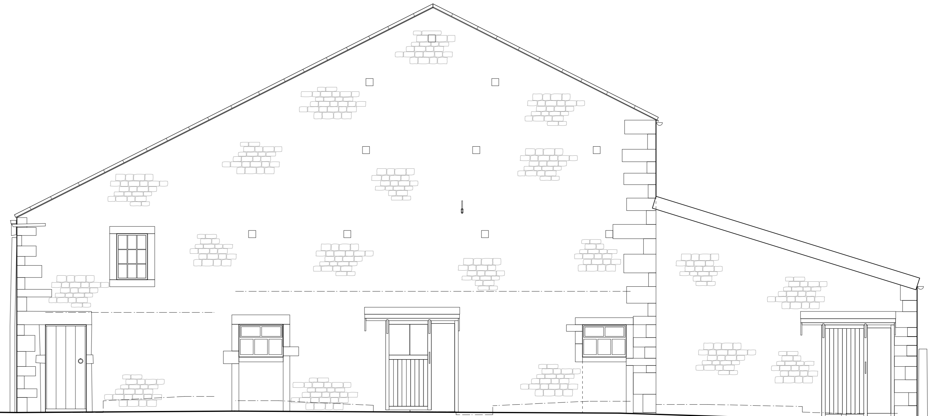
Existing East Elevation - 1:50