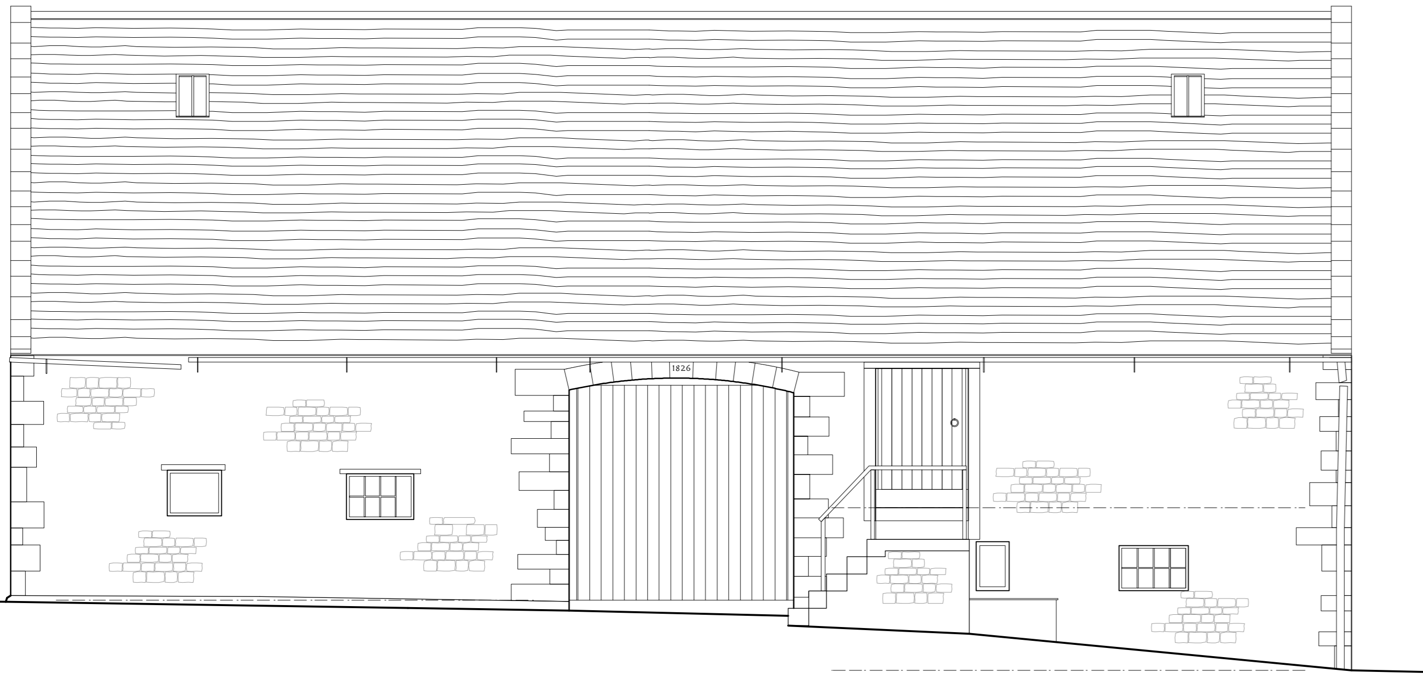
Existing South Elevation - 1:50