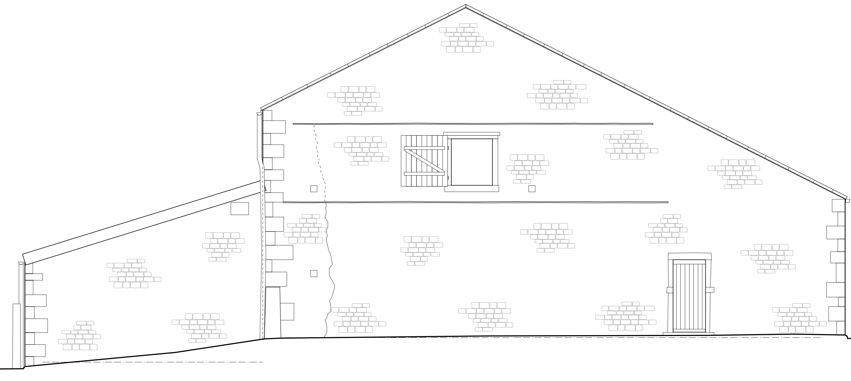
Existing West Elevation - 1:50