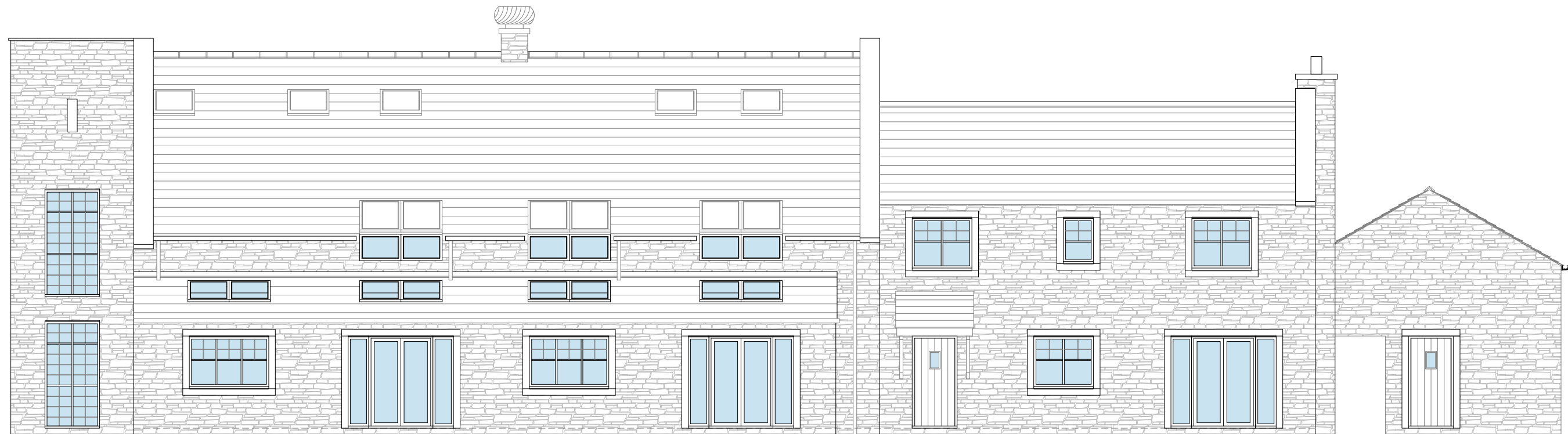
Rear Elevation Plot 28