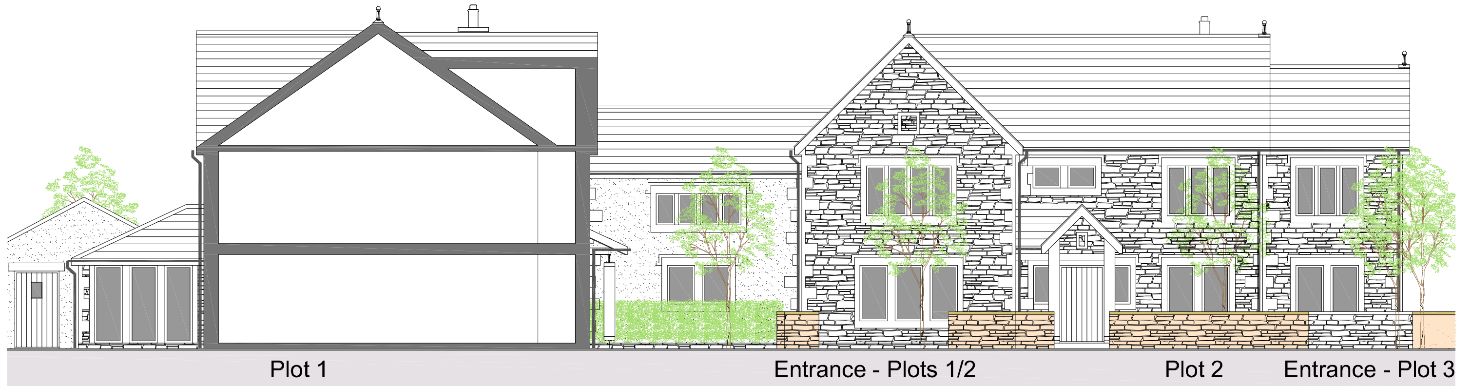
Sectional Elevation C-C